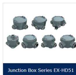
Junction Box Series EX-HD51

FEEL FREE TO CONTACT US FOR MORE INFORMATION ABOUT OUR PRODUCT