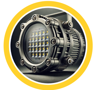
EX LED PROOF LIGHTING

Daeyang lighting systems are engineered to enhance safety, visibility, and operational efficiency in some of the harshest environments.