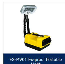
EX-MV01 Ex-proof Portable Light