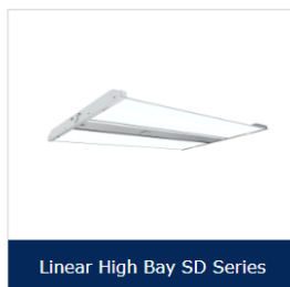
Linear High Bay SD Series