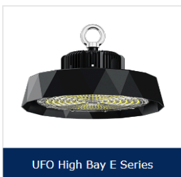
UFO High Bay E Series

Product range includes high bay lights, explosion-proof lights, sport lights, grow lights, stadium lights, and both indoor and outdoor commercial and industrial lighting solutions. These products are applied in various settings such as residential and commercial areas, educational institutions, gymnasiums, warehouses, and hazardous locations