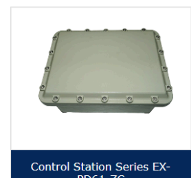
Control Station Series EX-PD61-ZC