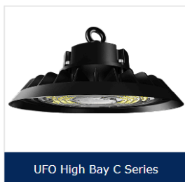
UFO High Bay C Series