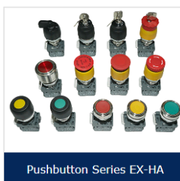
Pushbutton Series EX-HA