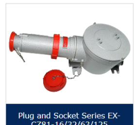
Plug and Socket Series EX-CZ81-16/32/63/125

FEEL FREE TO CONTACT US FOR MORE INFORMATION ABOUT OUR PRODUCT