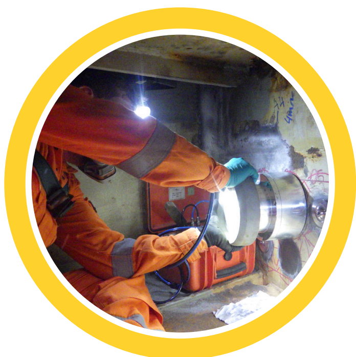
HULL REPAIR (COLD PAD - ALTERNATIVE METHOD)