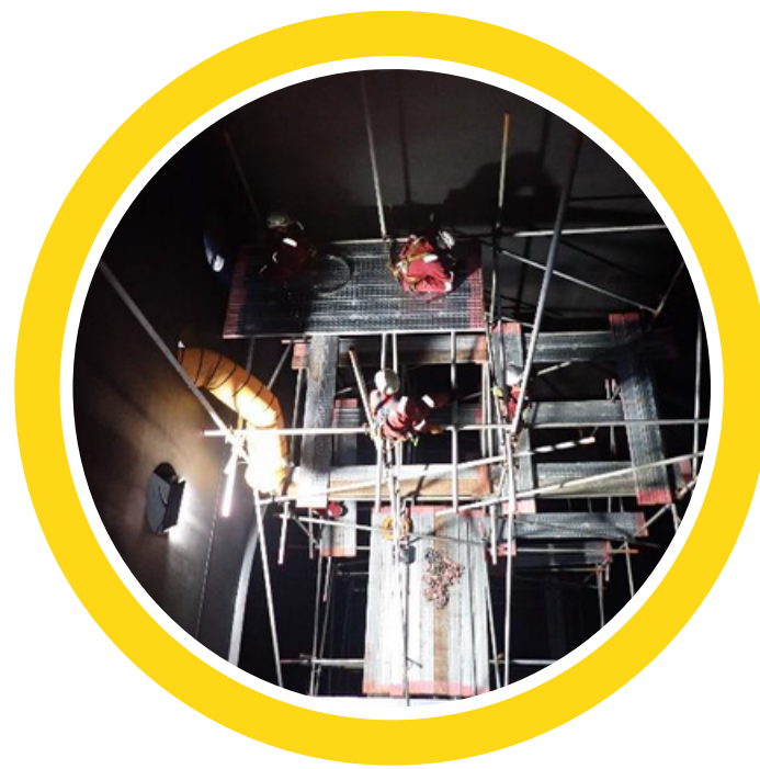
HULL REPAIR (CROP & RENEW)